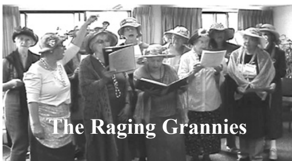
The Raging Grannies

For complete information on added dates and places, follow the weekly updates in The Madison Times, and visit our website www.tntsenioridol.org regularly.