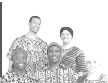
Woezo Dance Group