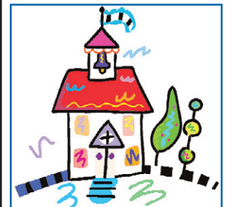
For the Young and Young at Heart Page 5