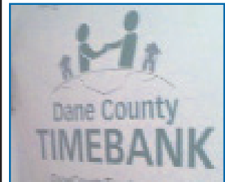
TimeBank Store Maxine's Page 8