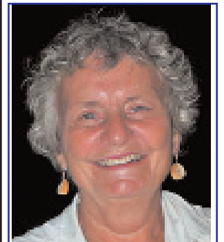
Building Bridges page 2

Join us for the Anna Mae Mitchell Senior Idol-Saturday, February 27th 2:00 - 4:00 pm Oakwood Village West 6201 Mineral Point Road For more info call 608-770-2049